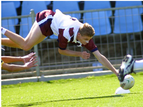
Despite this spectacular Touchdown by QSST they failed to defeat the Mets