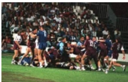
(You had to be there)

Brisbane was the next venue in 1998 and after losing the opening game, Qld went on to win the series. Their first series defeat was in the following year on the Gold Coast when after winning the opening match they lost the next two.